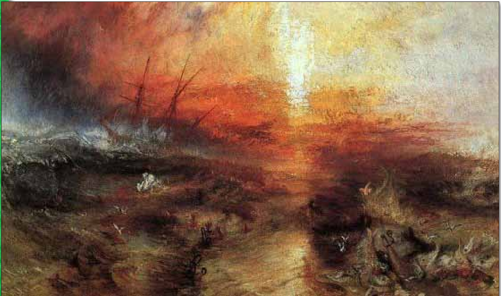
J.M.W. Turner, Slave Ship (Slavers Throwing Overboard the Dead and Dying—Typhoon Coming On) , 1840. In "Turner's Modern World," Museum of Fine Arts, Boston, MA