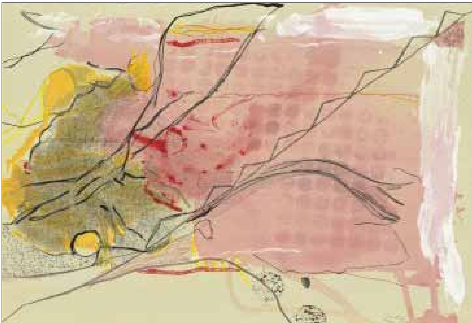
Helen Frankenthaler, Weeping Crabapple (detail), 2009. Woodcut on paper, artist's proof 2/12. In "Helen Frankenthaler: Un Poco Mas (A Little More)," Nasher Museum of Art, NC