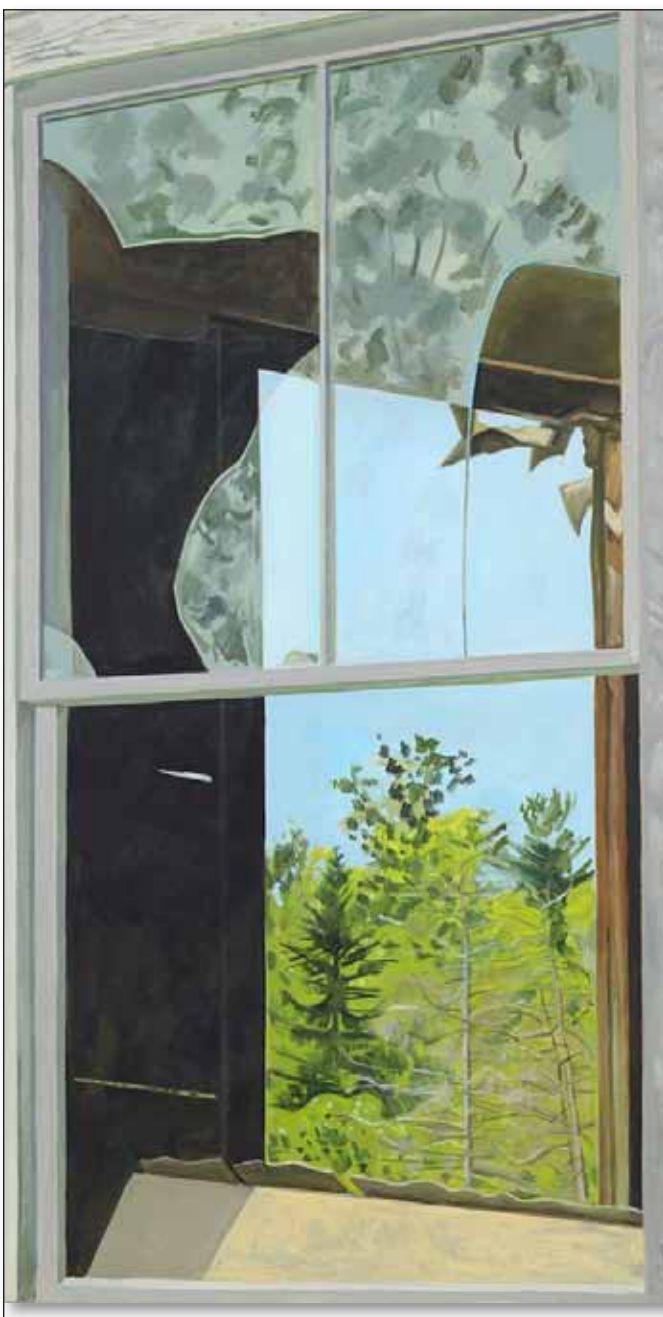
Lois Dodd, Broken Window with View , 1987. Oil on linen. In “The Open Window,” Springfield Art Museum, MO

Frye Art Museum , Seattle □ “Recent Acquisitions: Jeffry Mitchell” (July 24) Work that recalls childhood use of folded paper to form symmetrical designs with flowers displayed alongside bears, bunnies, and elephants. □ “Christopher Paul Jordan and Arnaldo James in the Interim: Ritual Ground for a Future Black Archive” (May 15) A dialogue between two Black artists whose aim, from distant perspectives (U.S. and Trinidad and Tobago), is to support Black creative communities across the diaspora: paintings on salvaged windows from Black neighborhoods (Jordan) and photographs based on Carnival performances. □ “Christina Quarles” (June 5) Paintings that merge the images of bodies and body parts with familiar domestic objects.