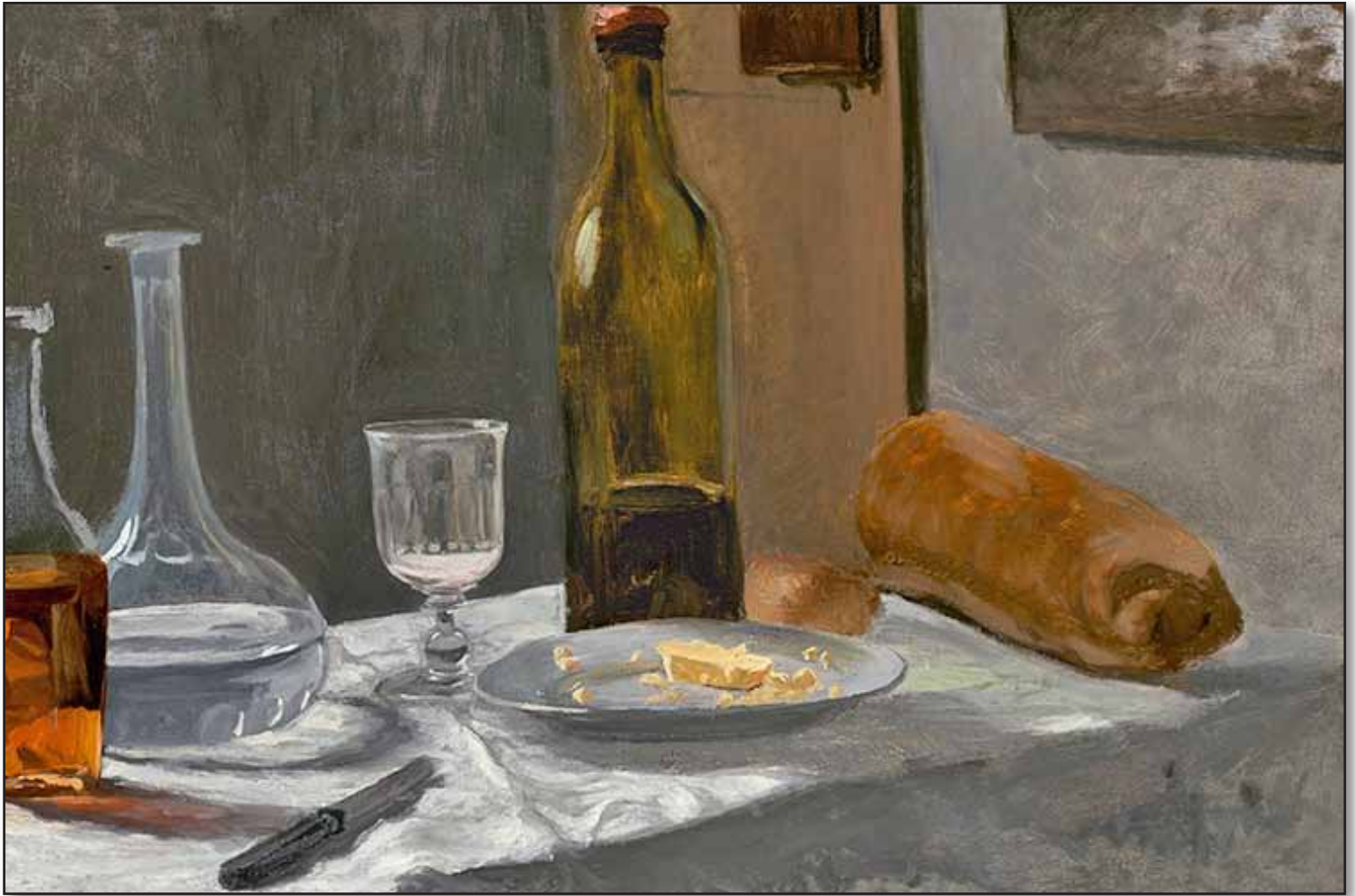
Claude Monet, Still Life with Bottle, Carafe, Bread, and Wine , c. 1863. Oil on canvas. In "One Each," Cininnati Art Museum, OH

Photographers Society: Scenes of Laurel Highlands" (May 29) Juried exhibition of images from this area or western Pennsylvania.