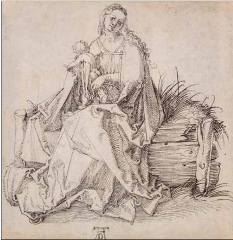
Albrecht Dürer, The Virgin and Child with a Flower on a Grassy Bench . 1503