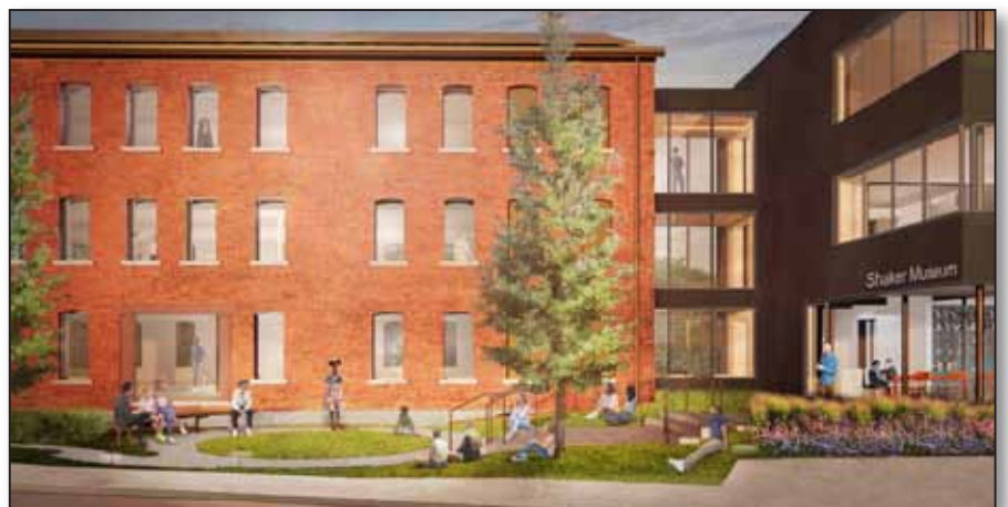
A rendering of the new home of the Shaker Museum and amphitheater in Chatham, N.Y.

Kelly admired and drew inspiration from the simplicity of the Shaker form and design. The foundation in his name supports, not only the Shaker Museum, but also the arts, environmental conservation, historic preservation, conservation of modern art, and restoration of world heritage sites. □