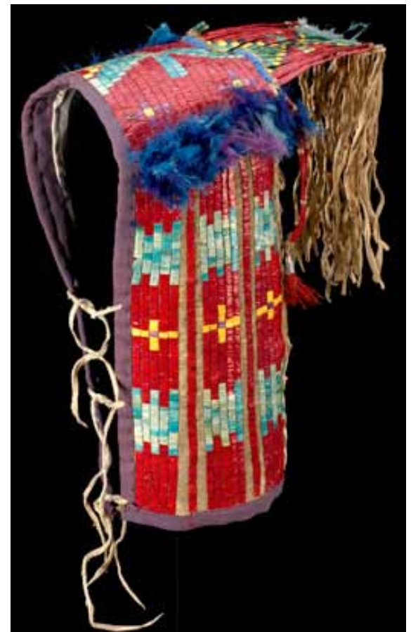
Lakota model baby carrier with porcupine-quill embroidery, North or South Dakota, c. 1880. In "Our Universe," National Museum of the American Indian, DC