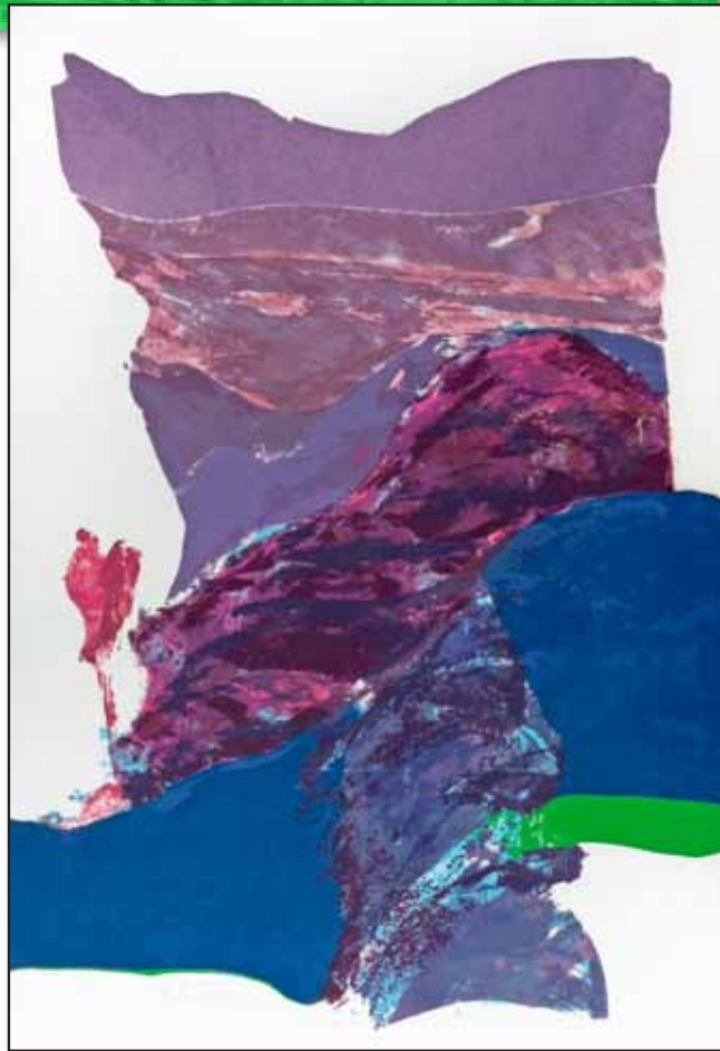
Lou Stovall, Sundrinkers are we...the forest, the trees. , 1971. Screenprint. Lou Stovall: On Inventions and Color , Kreeger Museum, DC

Smithsonian American Art Museum □ “Composing Color: Paintings by Alma Thomas” (Apr. 21) Paintings that incorporate elements of gestural abstraction and color field painting—a distinctive style characterized by the interplay of pattern and hue. □ “Orchids: Hidden Stories of Groundbreaking Women” (April 24) Women who have enriched the understanding of orchids. □ “Sargent, Whistler, and Venetian Glass: American Artists and the Magic of Murano” (May 8) The 19th-century Venetian glass revival and the experimentation by Sargent and Whistler inspired by glass from Murano.