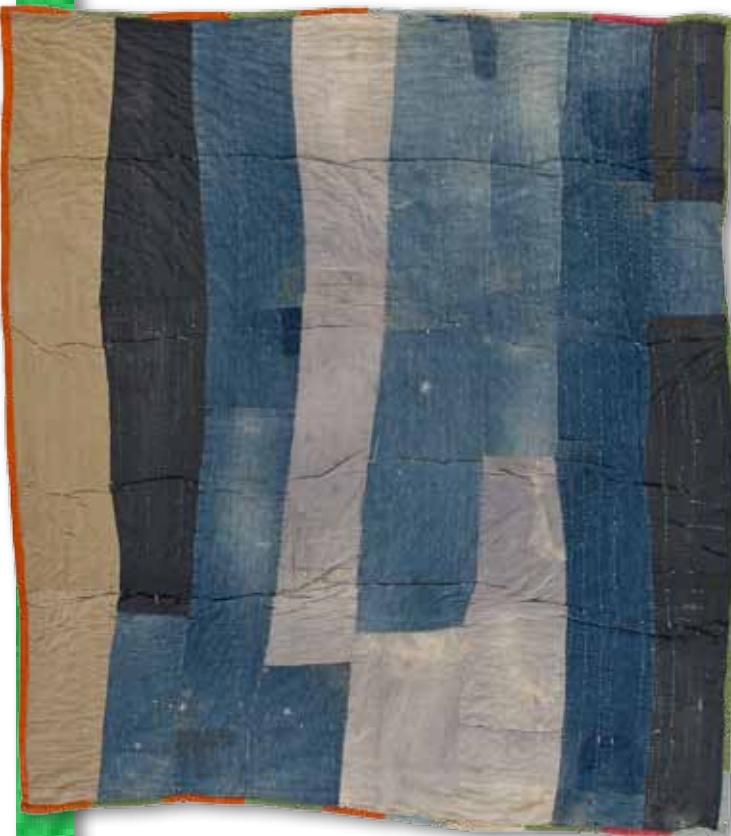
Beatrice Pettway, Quilt, Gee's Bend, Alabama, c. 1965. Cotton denim, corduroy. In "Pictures from Pieces," Speed Art Museum, KY