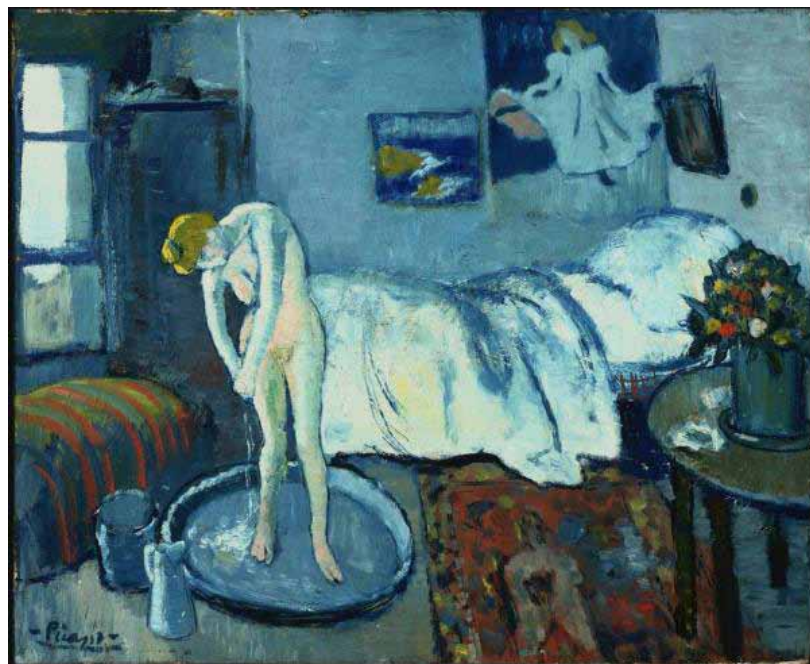
Pablo Picasso, The Blue Room (1901). In “Picasso: Painting the Blue Period,” Phillips Collection, DC