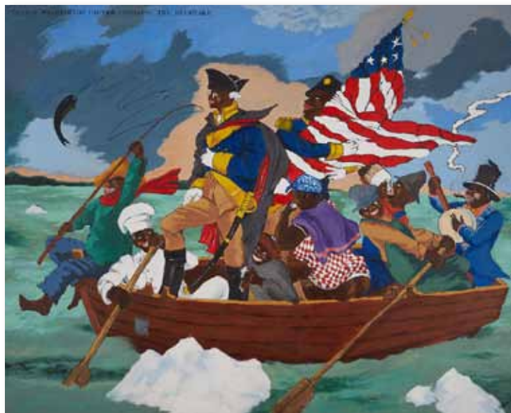
Robert Colescott, George Washington Crossing the Delaware : Page from an American History Textbook , 1975. At Lucas Museum of Narrative Art, CA