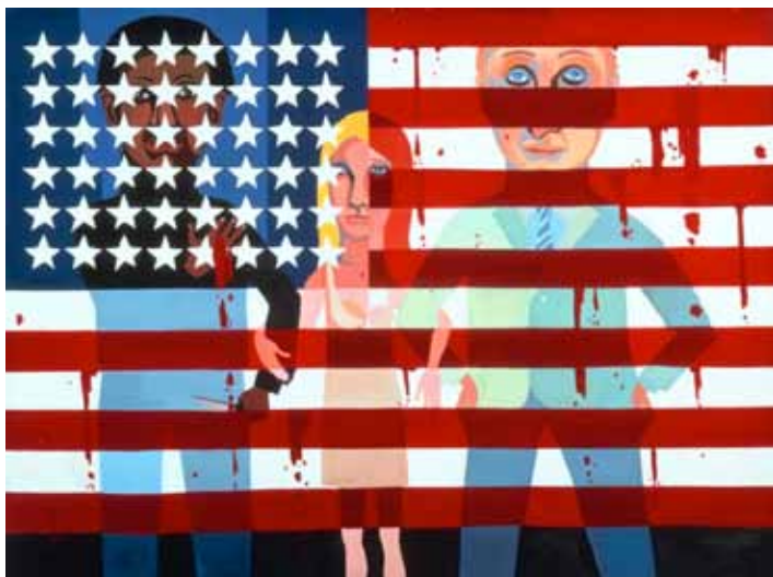
Faith Ringgold, American People Series #18: The Flag Is Bleeding , 1967. Oil on canvas. In "Faith Ringgold: American People," New Museum, NY

values, and truth. Include information about the ongoing Russian war in Ukraine into your public talks—mention this invasion at art and literature events that you attend or participate in. Bring this up at your exhibitions.