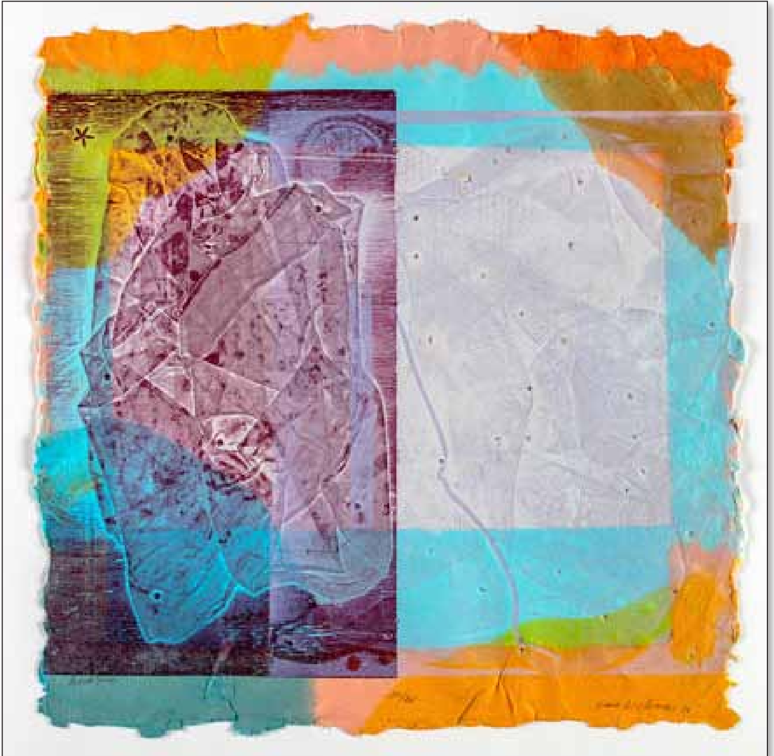
Sam Gilliam, Bardstown , 1976. Color etching on handmade paper. In "RAM Showcase: Abstraction," Racine Museum of Art, WI