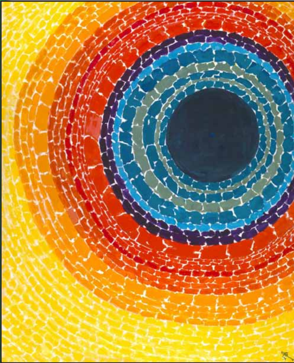
Alma Thomas, The Eclipse , 1970. Acrylic on canvas. In "Composing Color," Smithsonian American Art Museum, DC