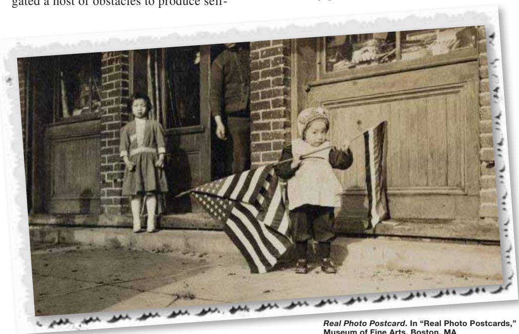
Real Photo Postcard. In “Real Photo Postcards,” Museum of Fine Arts, Boston, MA

art world and the car culture together. □ “By Her Hand: Artemisia Gentileschi and Women Artists in Italy, 1500-1800” (May 29) From Renaissance to Enlightenment, diverse and dynamic women navigated a host of obstacles to produce self-