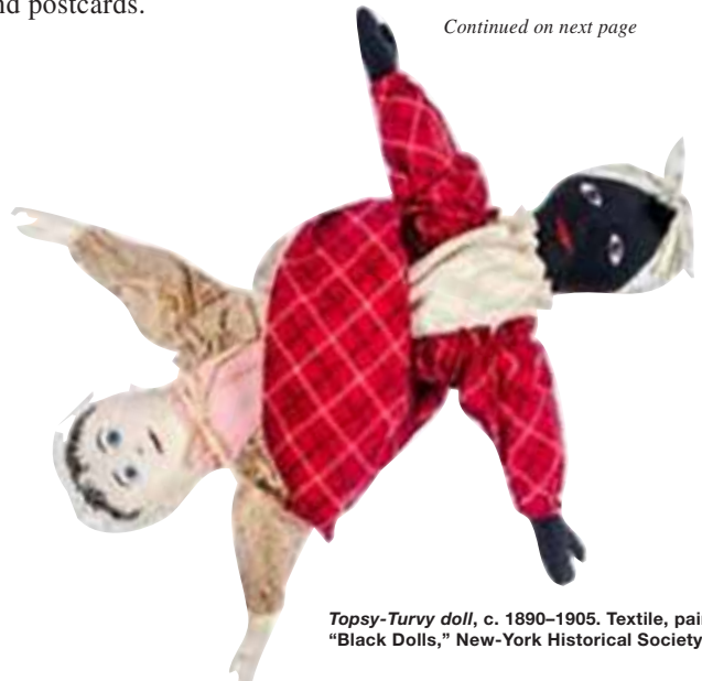
Topsy-Turvy doll , c. 1890–1905. Textile, paint. In "Black Dolls," New-York Historical Society, NY