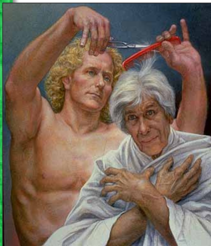
Paul Cadmus, The Haircut , 1986. At Lucas Museum of Narrative Art, CA