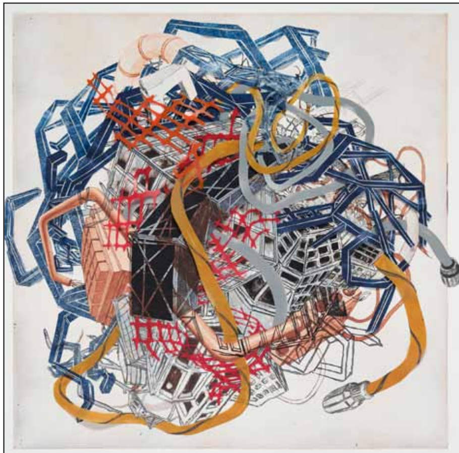
Nicola López, Urban Transformation #5 , 2009. Etching, lithography, and woodcut with Mylar elements. In “Positive Fragmentation,” National Museum of Women in the Arts, DC