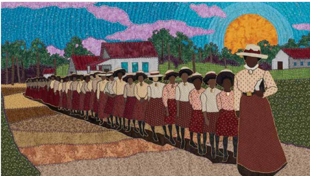
Stephen Towns, Mary McLeod Bethune (detail), 2021. Natural and synthetic fabric, polyester and cotton thread, crystal glass beads, metal and resin buttons. In “Stephen Towns: Declaration & Resistance,” Westmoreland Museum of American Art, PA

A non-collecting contemporary art museum, the institute will focus on both emerging Bay Area artists and established local and international artists. With an 11,00-square-foot space, the institute is able to host extra-large-scale installations.