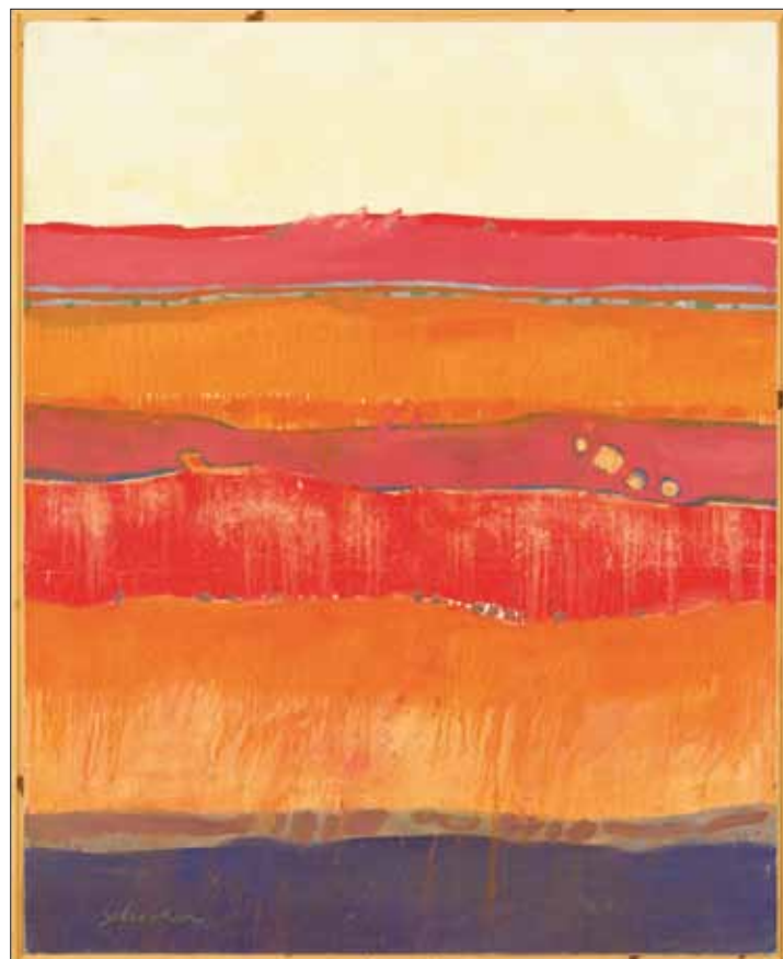
Fritz Scholder Mission/Luiseño, New Mexico #40, 1966. Acrylic on canvas. In "Action/ Abstraction Redefined," Cahoon Museum of American Art, MA