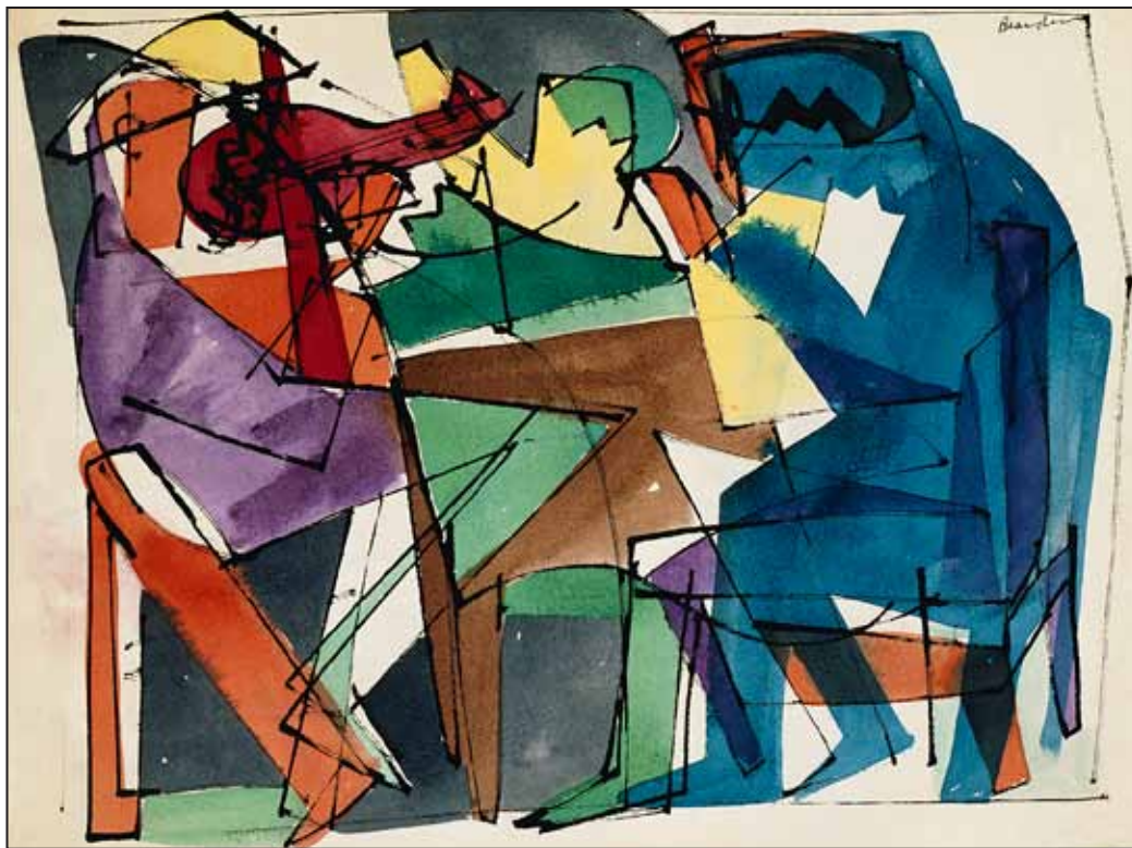
Romare Bearden, The Blues Has Got Me , 1944. Watercolor and ink on paper. In “Romare Bearden: Abstraction,” University of Michigan Museum of Art, MI

art world and the car culture together. □ “By Her Hand: Artemisia Gentileschi and Women Artists in Italy, 1500-1800” (May 29) From Renaissance to Enlightenment, diverse and dynamic women navigated a host of obstacles to produce self-