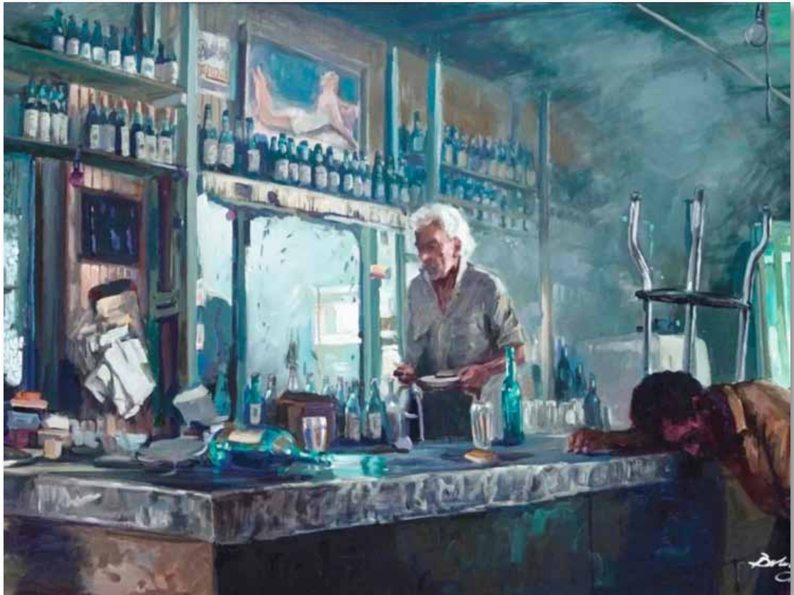
Bob Dylan, One Too Many , 2020. In the Bob Dylan Center, OK

The Bob Dylan Center opens with the Bob Dylan archive of more than 100,000 items spanning his entire career as its centerpiece to tell the story of this iconic songwriter, performer, and visual artist. Handwritten manuscripts, unreleased concert recordings, and more music combine with his output of paintings and sculptures to fill out the creative history of a popular idol.